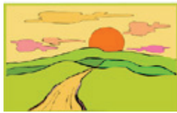
Sunrise: 5:39 a.m.