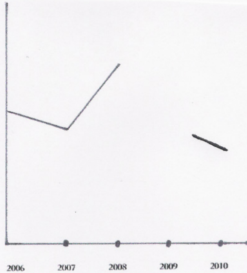
Chart 1: Crime rate